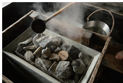
i. Löyly