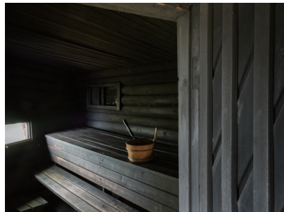
d. Interior of the Koetalo sauna