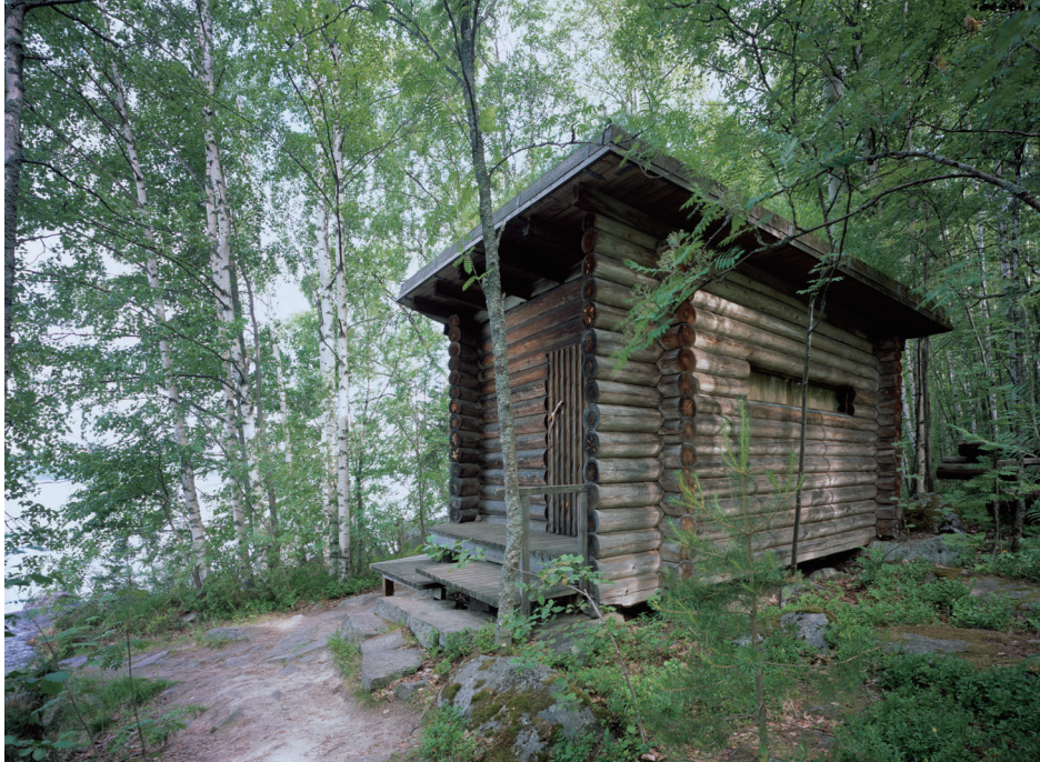
Koetalo sauna hut (Jyväskylä, 1952-54)

Exhibition Period: December 19 (Fri.), 2025 to March 5 (Thu.), 2026