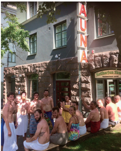
h. Helsinki's oldest public sauna "Kotiharjun Sauna"