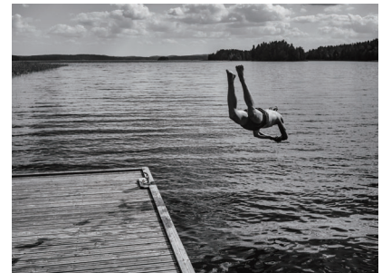
g. Diving into the lake after the sauna