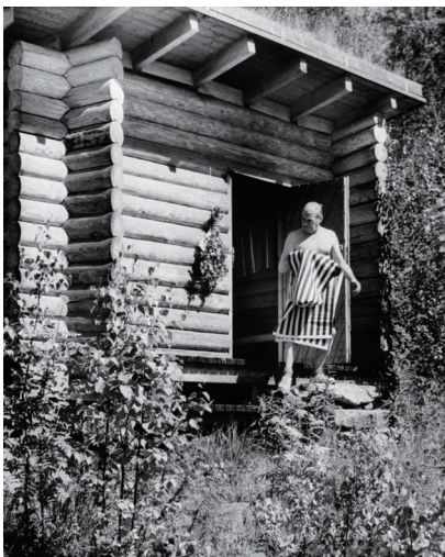
c. Alvar Aalto enjoying the sauna in the Koetalo sauna hut