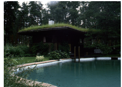
e. Sauna at Mairea House