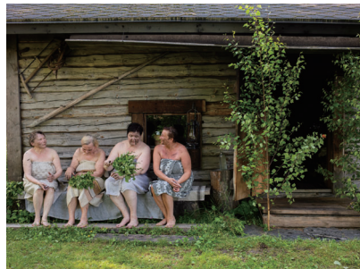
f. People cooling down in front of a sauna hut