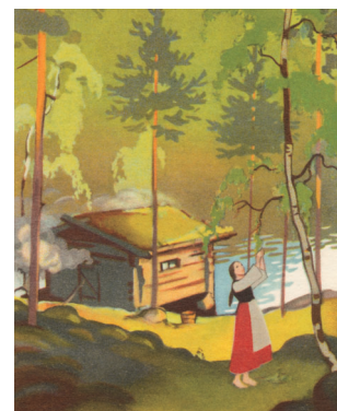
j. Illustration by Marja Vendelin (1930s–1950s)