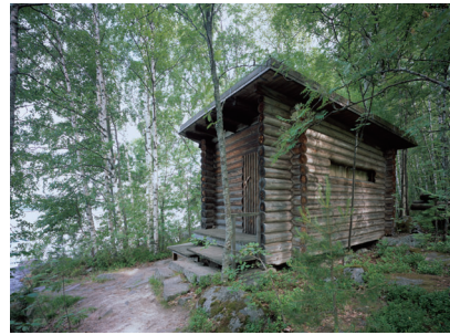
b. Koetalo sauna