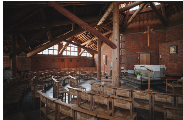
d. Catholic Shibata Church