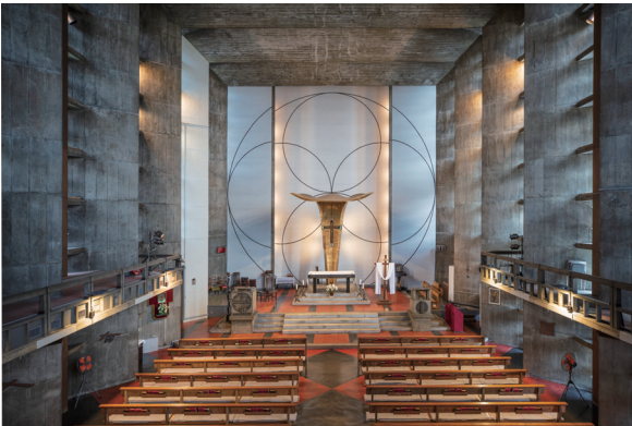
c. St. Anselm Catholic Church, Meguro