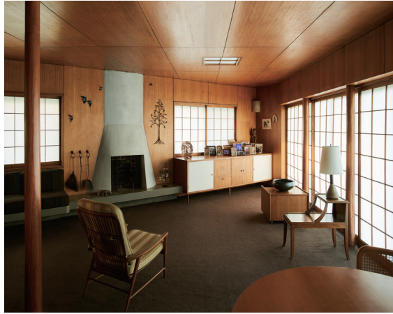
b. Former Ito Residence