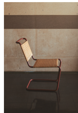
j. Chair from Shiro Akaboshi's villa Collection: Raymond Architectural Design Office