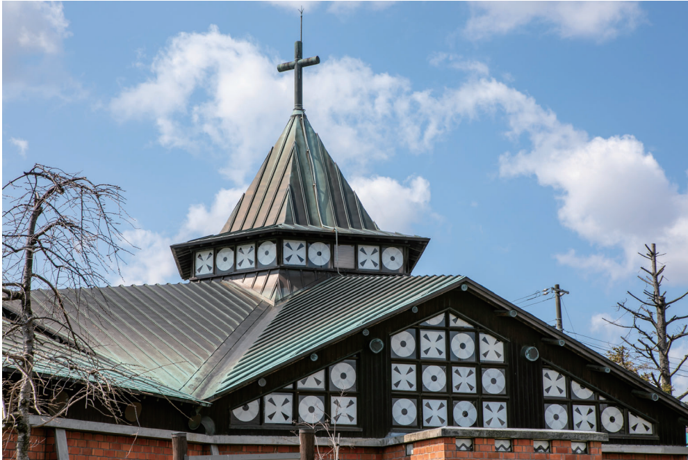
Main visual: Catholic Shibata Church

Exhibition Period: Thursday, March 19, 2026 – Thursday, June 18, 2026