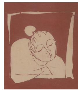
g. Screen printed on paper