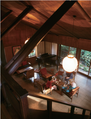
a. Cunningham Memorial House