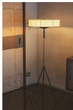
i. Floor lamp Collection: Raymond Architectural Design Office