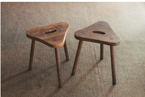
h. Triangular chair Collection: Raymond Architectural Design Office