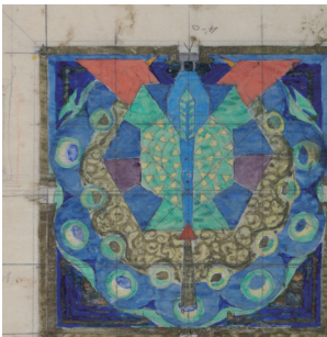
e. Decorative study for the Peacock Room, Imperial Hotel Collection: Kitazawa Architects